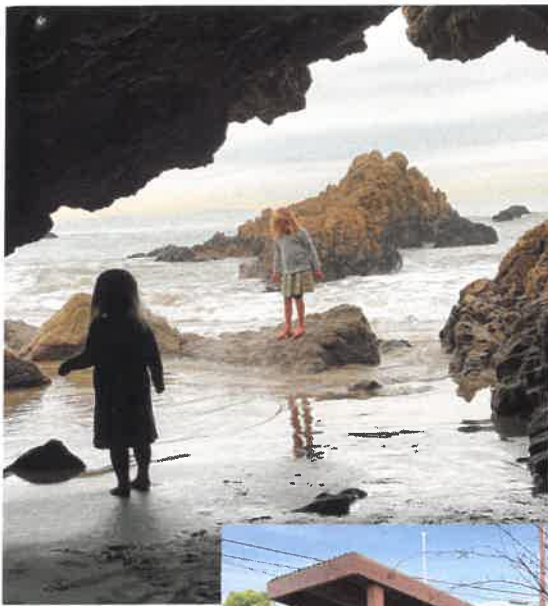
Exploring beach caves