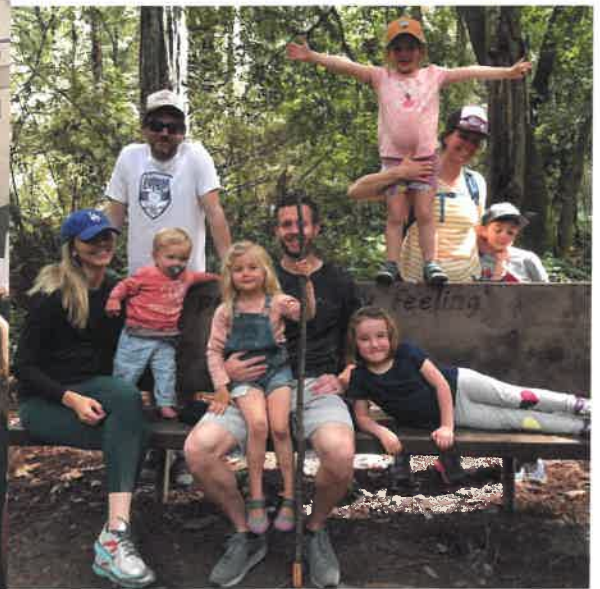
Hiking with cousins