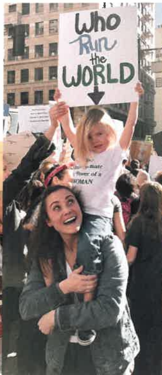
Women's march with auntie