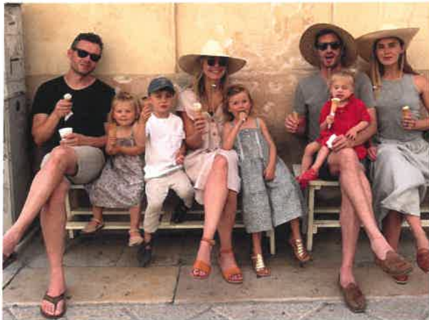
Gelato in Italy with friends