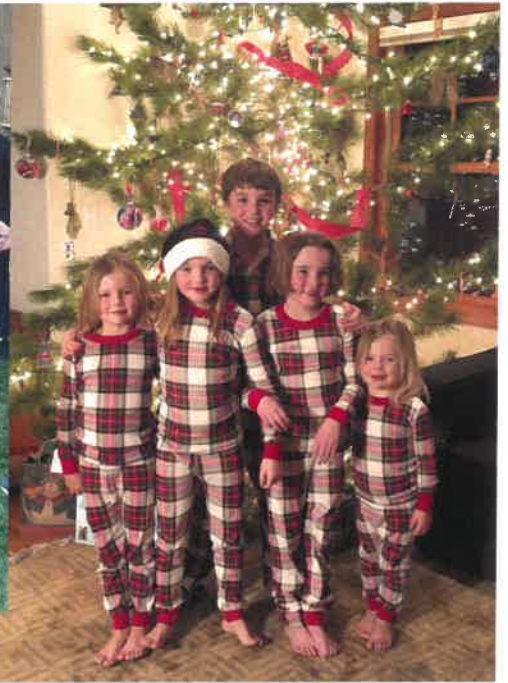
Matching Christmas PJ's with cousins