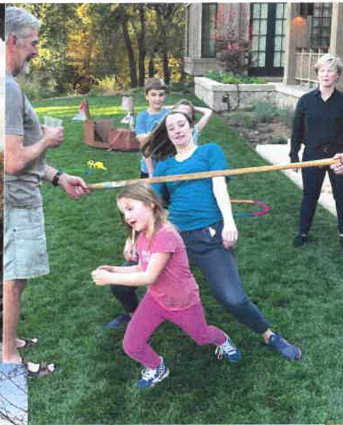
Limbo at a family reunion