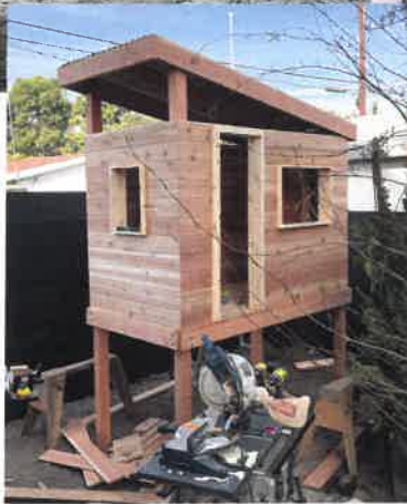
Tree house dad built