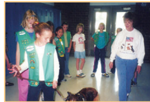
Grandma teaches the Girl Scouts dog training.