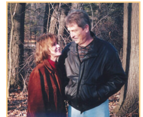
A quiet moment in the backyard.