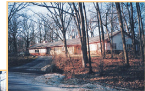
Our home in February, 2006.

Inside our home we have lots of books, enough toys and all the necessary essentials to provide our children with a comfortable, yet not excessive lifestyle.