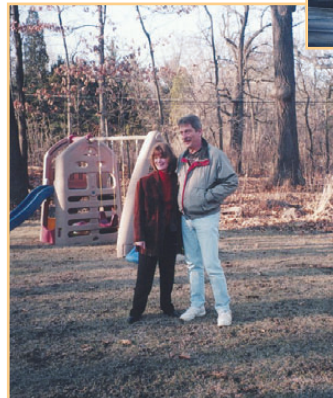
In the backyard.