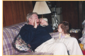
Grandpa enjoys music.