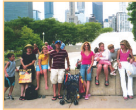
A family outing in the Windy City.

Our family and friends were active in our own upbringing, and similarly, they will play a vital role with our children. We were raised with stay-at-home mothers, nightly family dinners and weekends and holidays shared with the warmth and good times of relatives and friends. We want the same lifestyle for our children