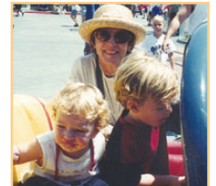
Grandma and grandchildren enjoy Disneyland.

Our siblings and their spouses are professionals in the medical, legal and investment professions. Our children will have lots of fun playing with their cousins. Everyone is healthy and dedicated to the family.